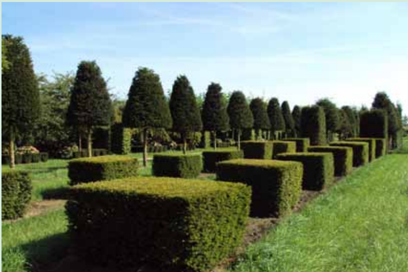
Taxus in various forms