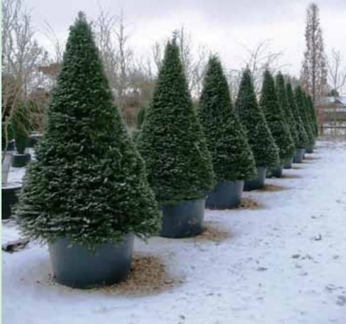
Taxus baccata clipped cones

Taxus baccata is a medium sized, evergreen conifer, native to Britain, much of Europe and parts of Asia and Africa. It is tolerant of a wide range of growing conditions including shade and chalk but not waterlogged or poor draining soil. It is widely used in landscaping as its relatively slow growth and tolerance of pruning make it an ideal plant for hedging and topiary.