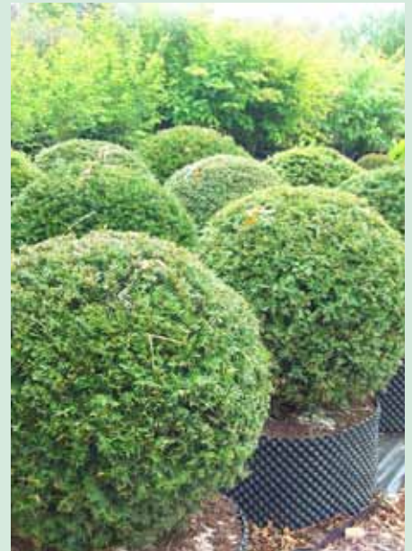
Taxus clipped balls