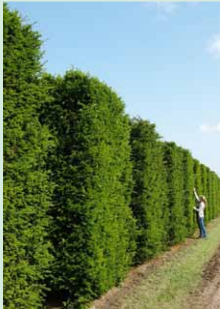
3m clipped hedging units