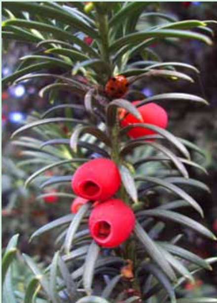
Red, berry like aril