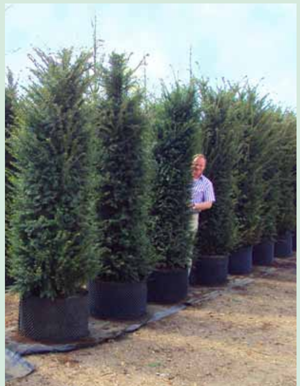
Taxus baccata 2m plants

Fruit: Seeds are surrounded by a red, berry-like fruit.