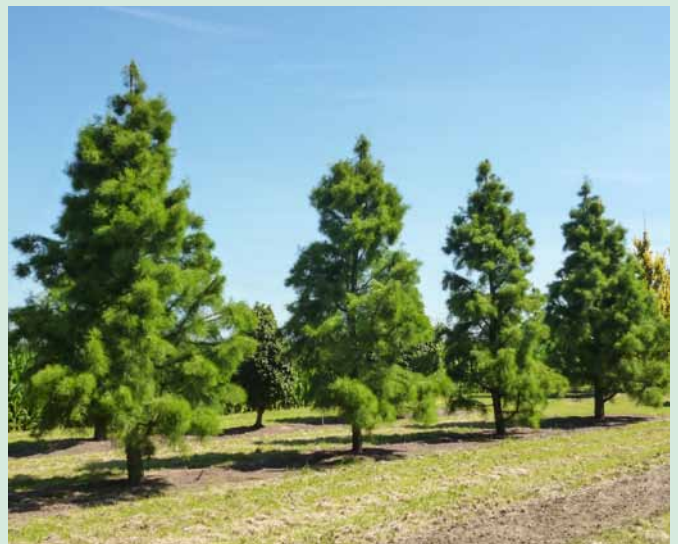
5m mature specimens of Taxodium ascendens Nutans