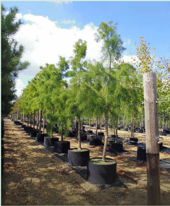
Taxodium ascendens Nutans 20-30cm girth half stems

Taxodium ascendens Nutans (Pond Cypress) is a very distinctive and interesting tree.