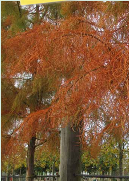
Stunning colour in Autumn