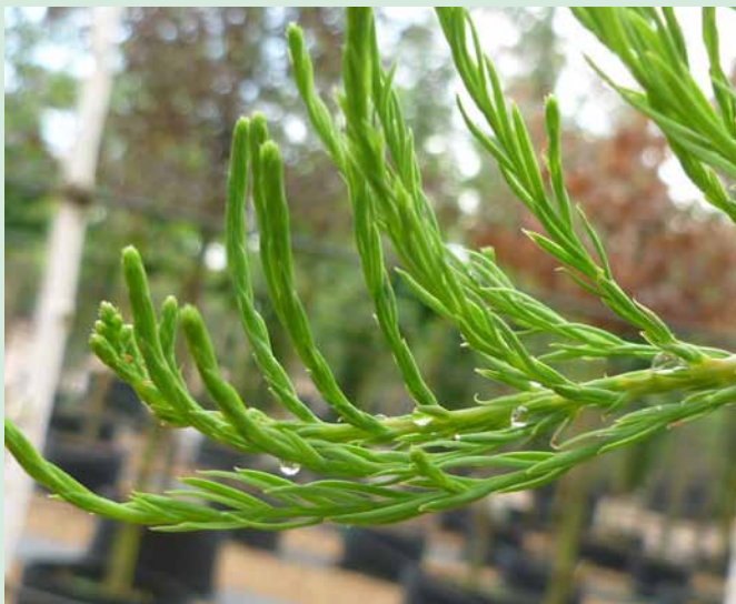
Upright foliage of Taxodium Nutans