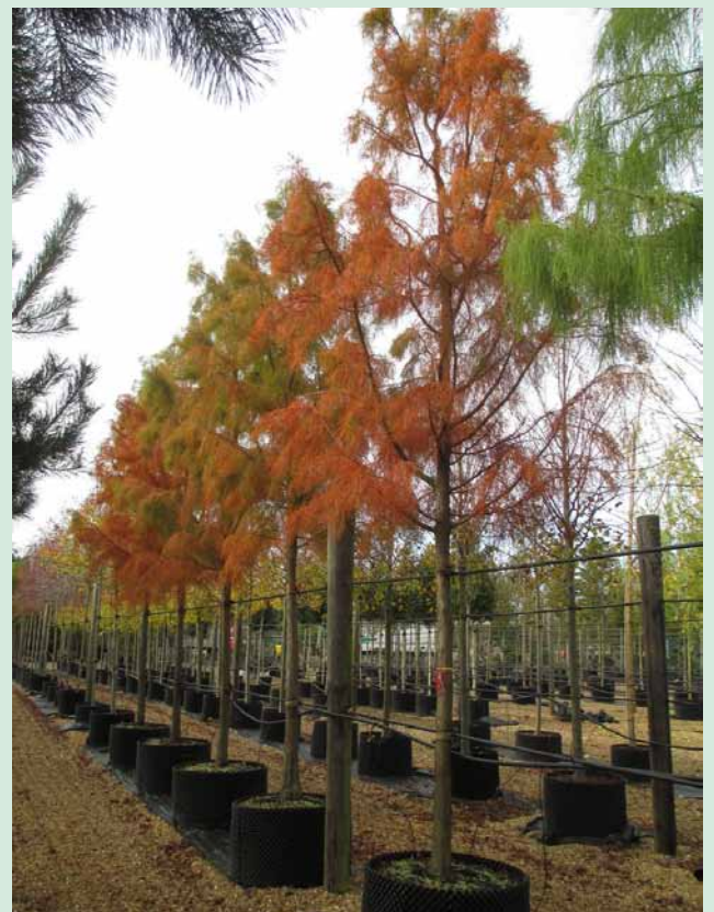
Ablaze with colour in the Autumn