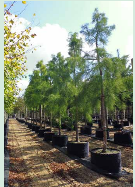
Pond cypress half stems