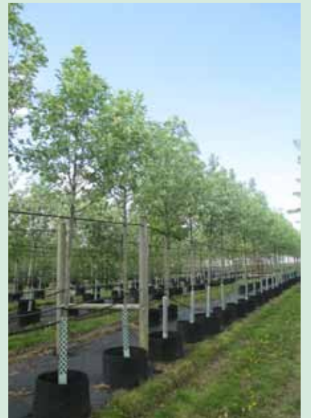
12-14-16cm girth Whitebeam trees