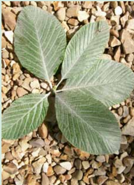
The downy foliage in springtime