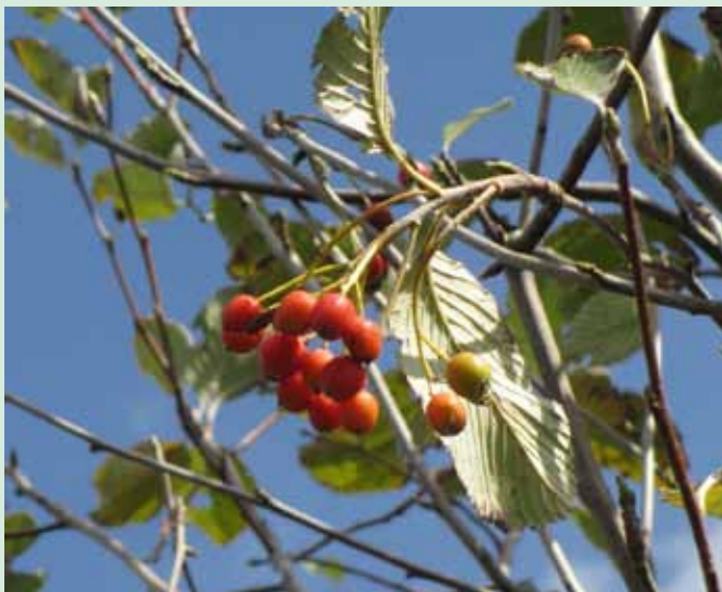
Autumn berries of Sorbus aria Lutescens