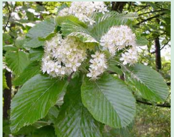
Clusters of white scented flowers in May