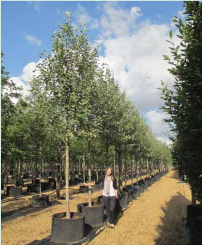
Sorbus aria Lutescens—a superb choice for urban planting

Sorbus aria Lutescens is a variety of the common Whitebeam, a small-medium sized tree native to Britain and Europe.