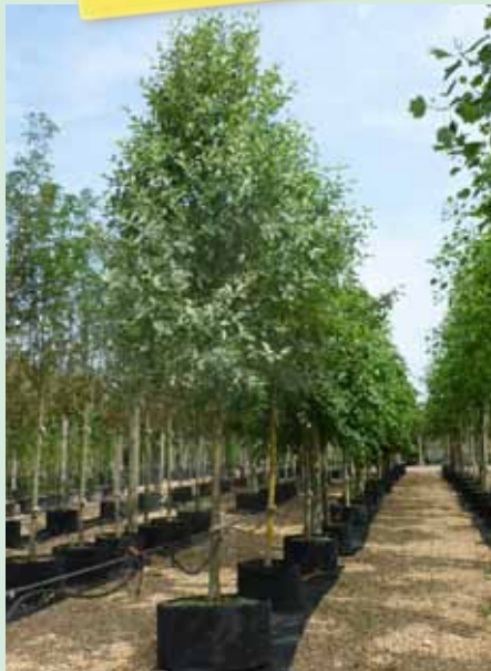
30-40cm standards in airpot container