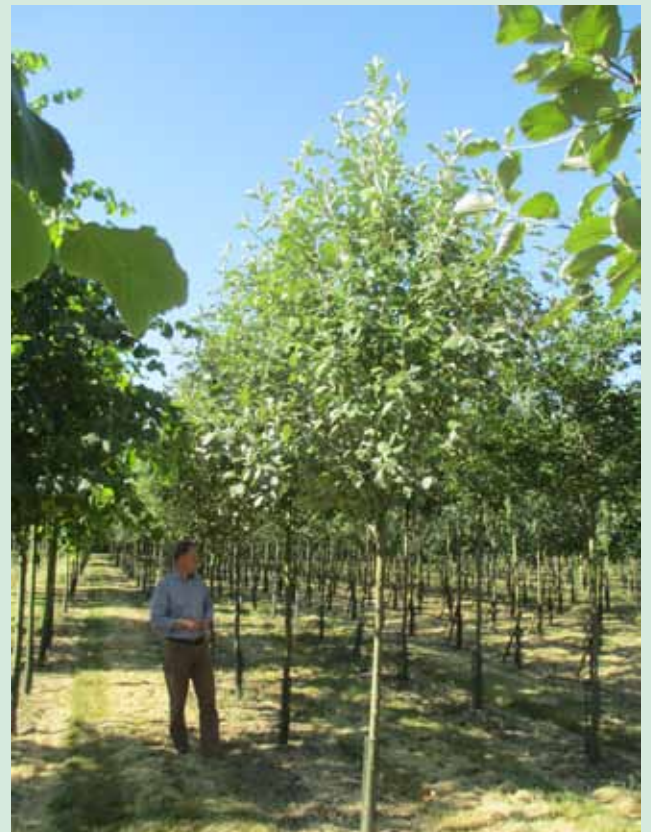
Whitebeam, 20-25-30cm girth standards, field grown

Fruit: Orange-red berries follow the flowers, ripening in autumn. Popular with wildlife