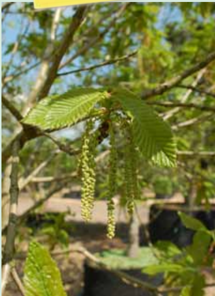
Male catkins in spring