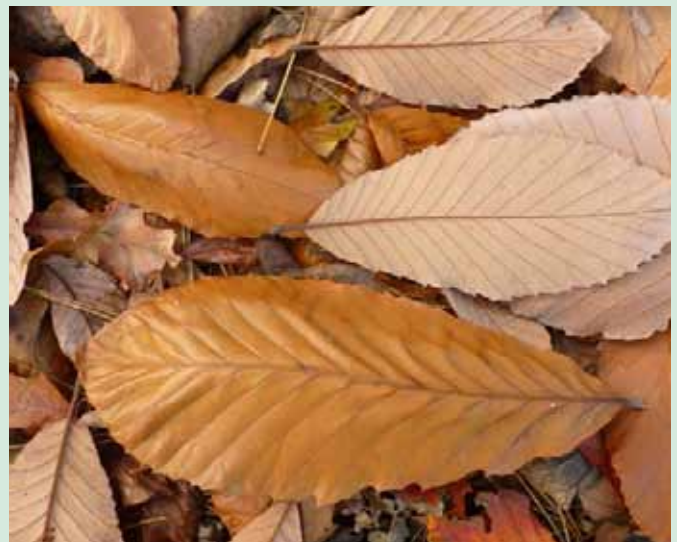
Autumn foliage of Armenian / Pontine Oak