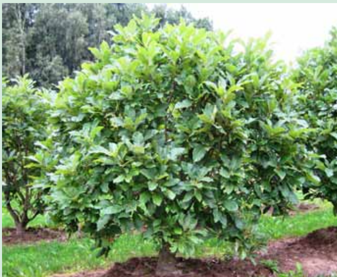
Quercus pontica 2-2.5m multistem