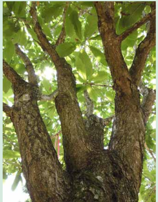
Mature bark of Pontine Oak

Fruit: Large acorns in clusters ripen in Autumn