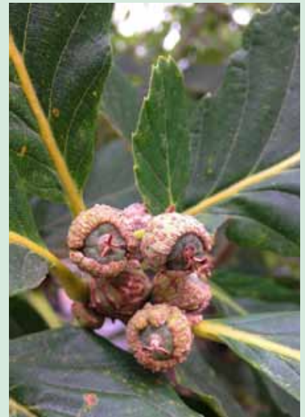
Acorn clusters grow large by autumn