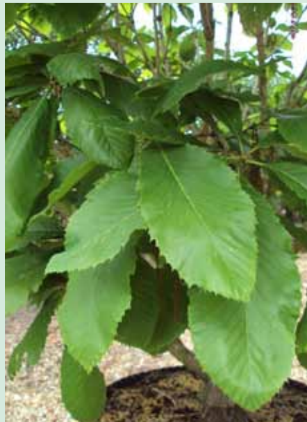
Large leathery foliage of Armenian Oak