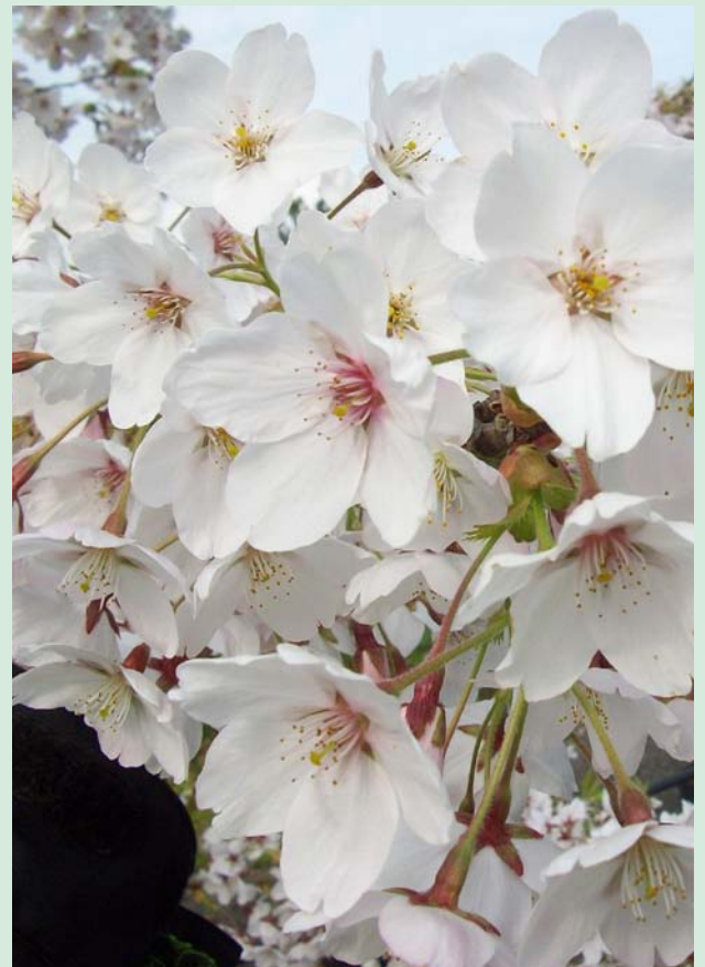
Flower of Prunus yedoensis

They are serrated on the margins and deep green in colour turning to red-orange in Autumn.