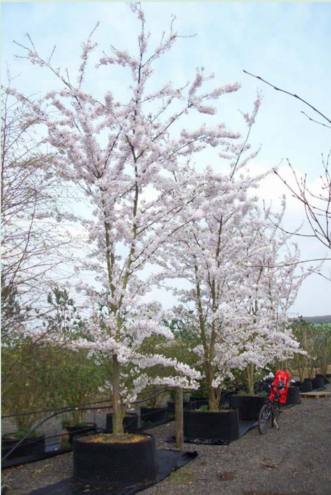
Prunus yedoensis 5m CG

Prunus yedoensis originated in Japan and is a large shrub / small tree of up to 12m tall. It is one of the most planted cherries in Japan and is found in profusion around the Japanese capital Tokyo.