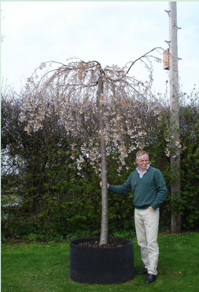
Prunus yedoensis lvensii