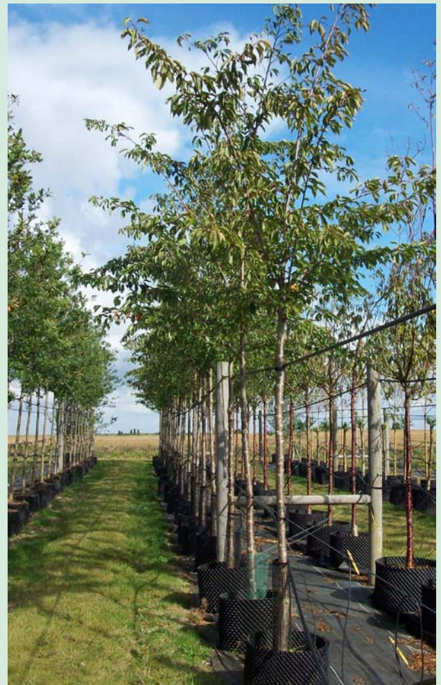
14-16cm Prunus yedoensis CG Standard