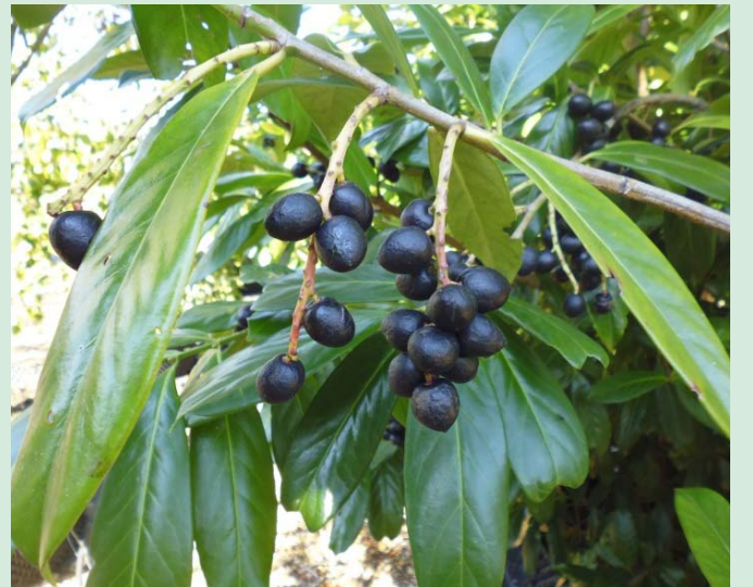
Fruits after turning black