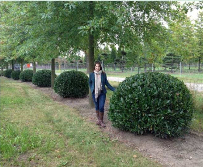
Prunus laurocerasus ball shape