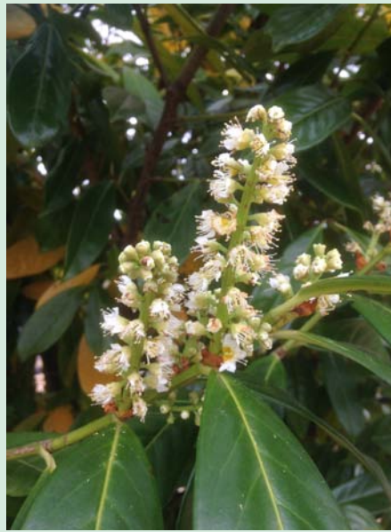
Raceme white flowers May to June