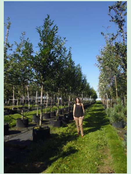
P. laurocerasus Caucasica