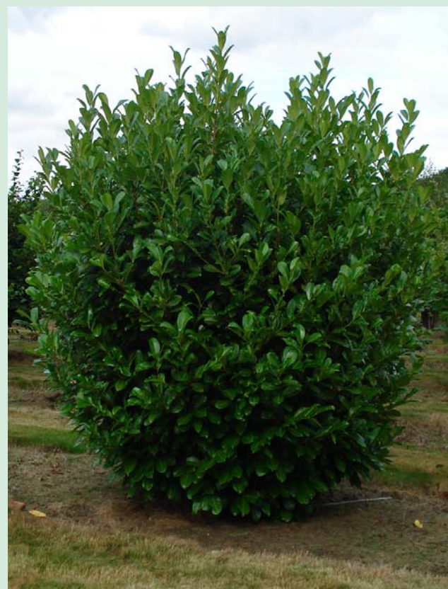
Multi Stem Cherry Laurel