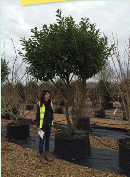
P. laurocerasus umbrella shape