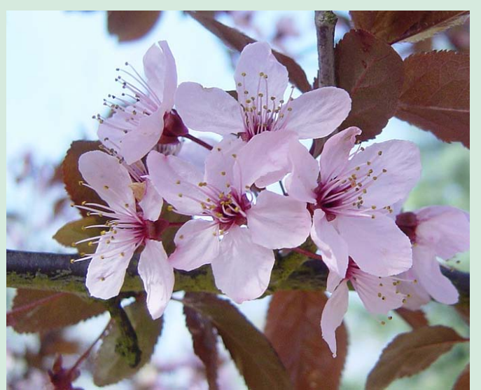
Pretty Pink Blossom in Spring