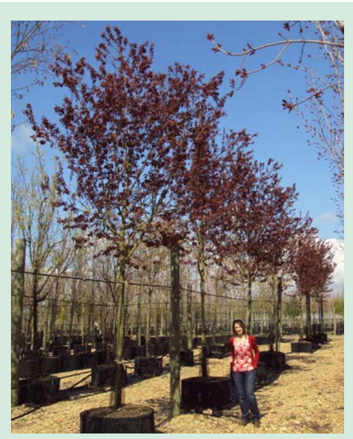
Standard Specimens in Summer