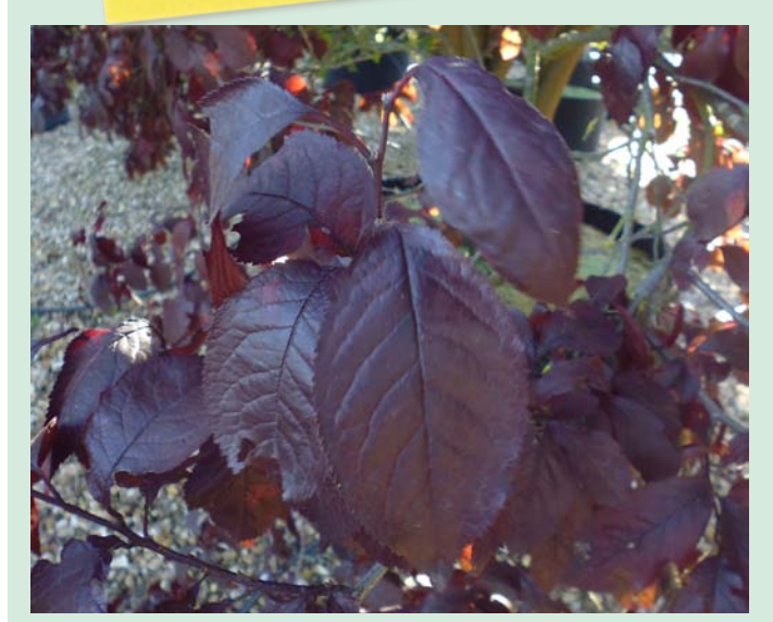
Dark Blackish Purple Foliage