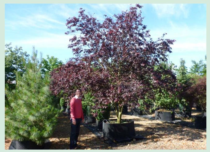
Multi Stem Black Cherry Plum in Summer