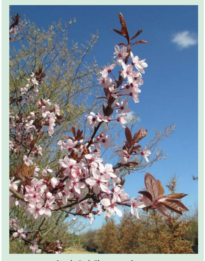
Single Pink Flowers in Spring