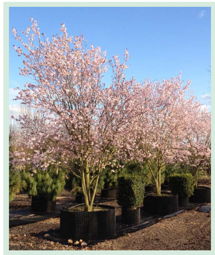
Prunus cerasifera 'Nigra' in early spring

Growing around 20-30cm a year it develops from a conical shape turning in maturity into a rounded crown with a fully mature height of around 5 to 7m with a 3 to 6m spread.