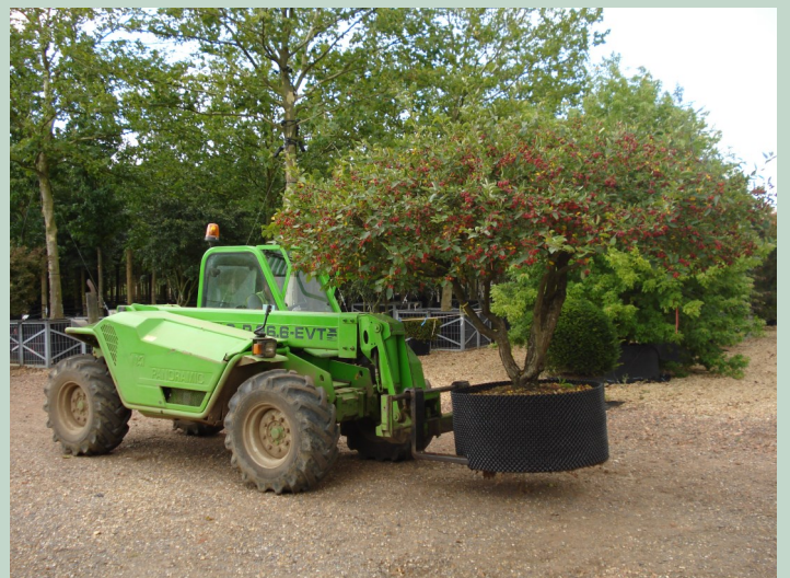
Malus toringo Sargentii CG