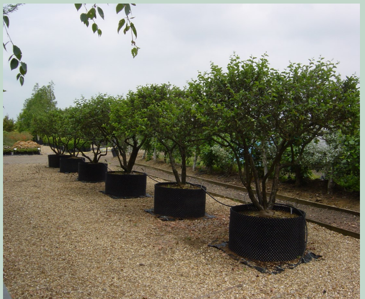
Malus toringo Umbrella CG