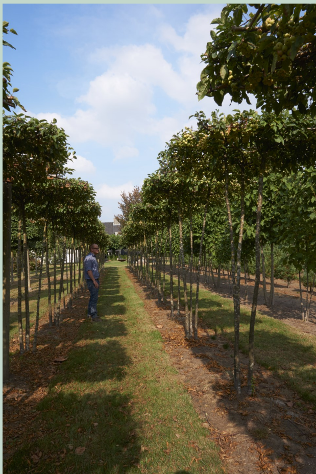
Malus toringo 2.5-3.0m Multistem Roof WRB