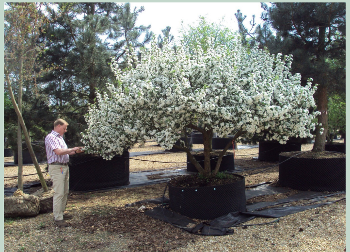
Malus toringo in Flower 2.5-3.0m CG

The Malus toringo is a valuable tree for the wildlife, offering food for the Bees, Butterflies and Birds.