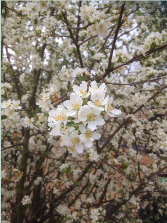
Malus toringo blossom

Malus toringo is a small Japanese crab tree with semi weeping branches that add to its unusual attraction. It was first introduced to the UK in 1856.