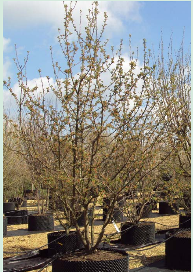
Container Grown Malus 'Winter Gold' 3m