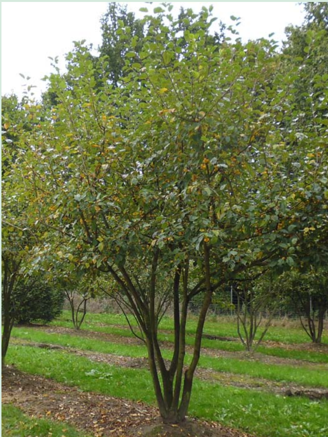
Field Grown Malus 'Winter Gold' 3.5-4m