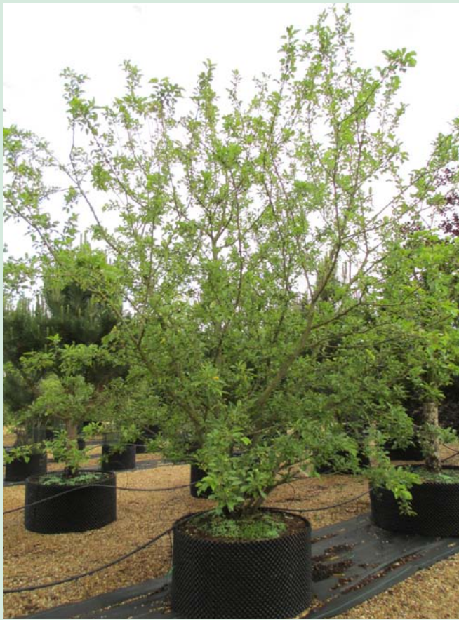
Malus 'Winter Gold' Multi Stem CG 3-3.5m

Malus, the genus of apples and crab-apples is made up of about 35 species with most being grown for their appealing often edible fruit and pretty fragrant flowers. In temperate regions these trees and shrubs are landscape and orchard essentials.