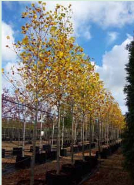
18-20cm girth standards in autumn