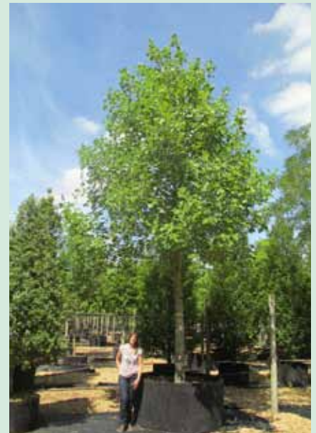
50-60cm girth Tulip tree