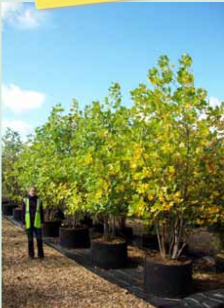
3-4m multistemmed Liriodendron