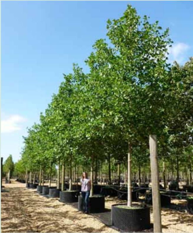
Liriodendron tulipifera 25-30cm girth standards

Liriodendron tulipifera is a firm favourite with all the staff at Deepdale Trees. This a large, fast growing and long lived tree, can reach to more than 35m high with tall straight stems.