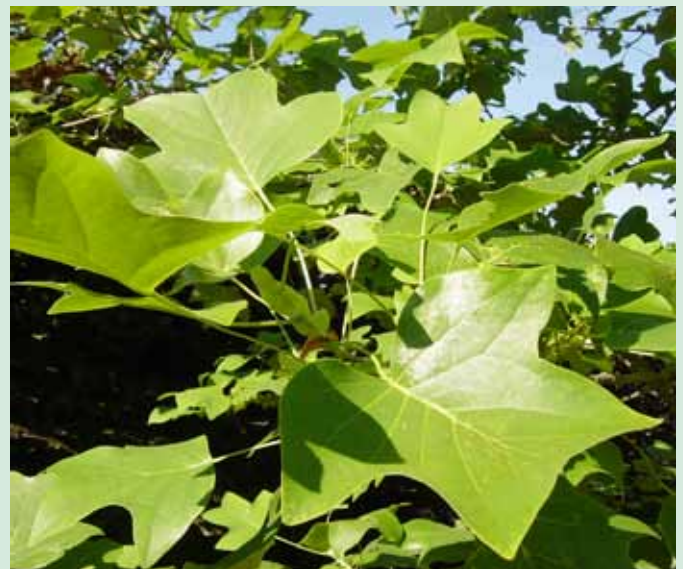
Summer leaves of Liriodendron tulipifera —totally unique!