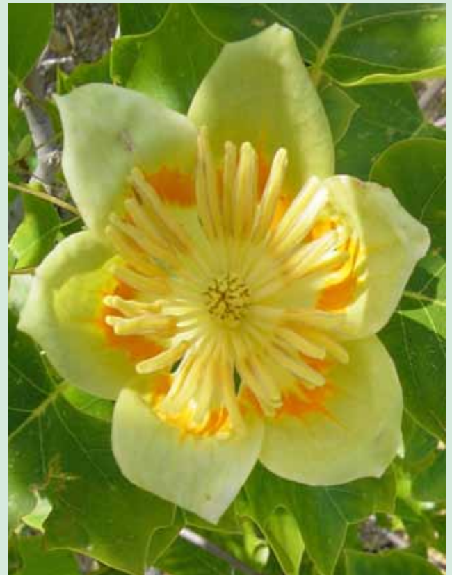
Beautiful tulip flowers after which the tree is named

Fruit: Clusters of winged seeds, similar to a cone.