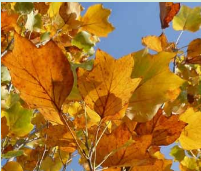
The glorious golden colours of the autumn foliage