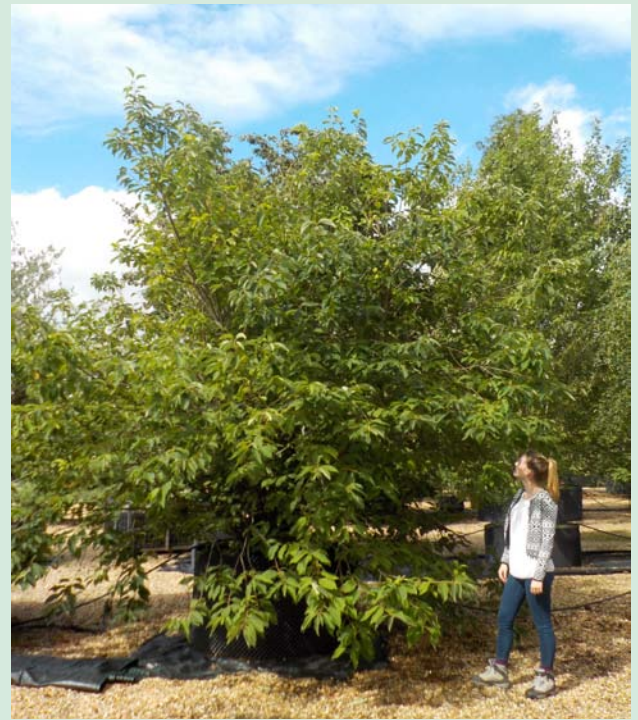
Halesia carolina Multi stem 3.5-4m

Squirrels use Carolina silver bells for food and the trees for dens. It's heavy flowering in spring and very attractive for the bees. Beekeepers speak highly of the species as an outstanding source for honey.