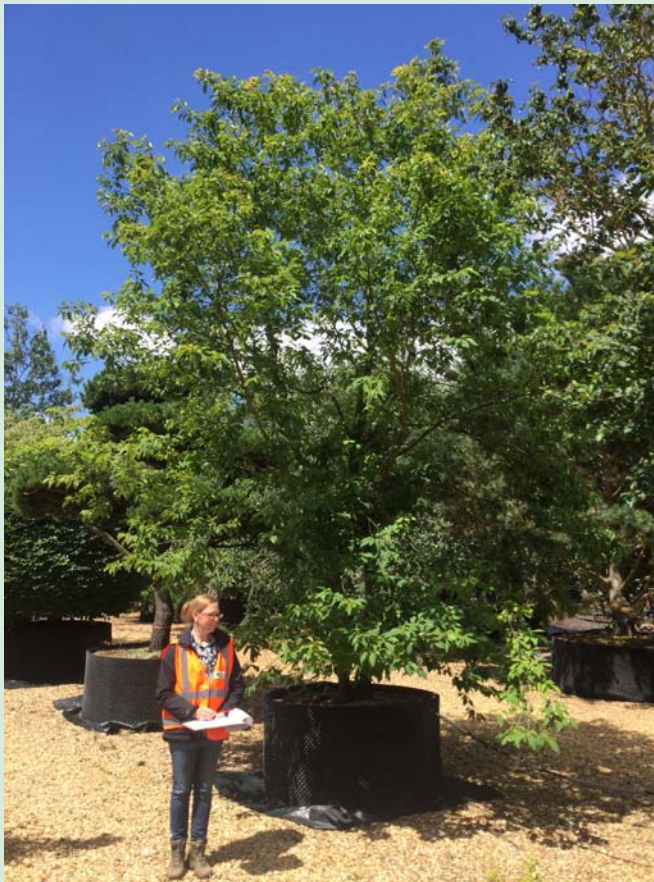
Halesia carolina Multi Stem 4.5-5m

Halesia carolina originated from the south-east United States with a broad rounded crown and is a lovely spreading tree up to 10m tall.