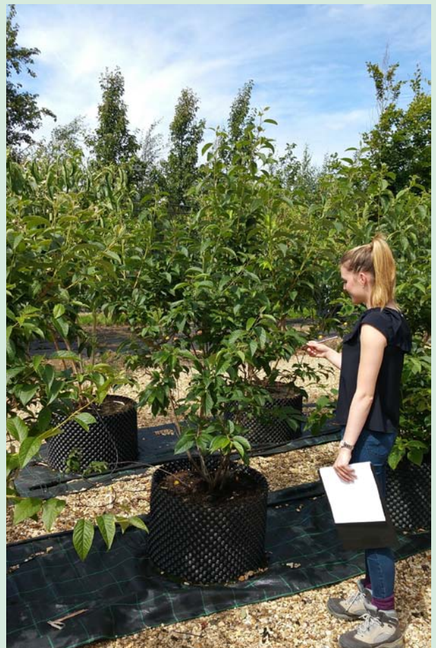
Halesia carolina Multi Stem 1.75-2m

The fruits of the tree which appear in the Autumn are not decorative but do add interest. They are yellowish green 2-3.5cm oblong capsules with four curious papery wings and a slender 'beak' on the end.