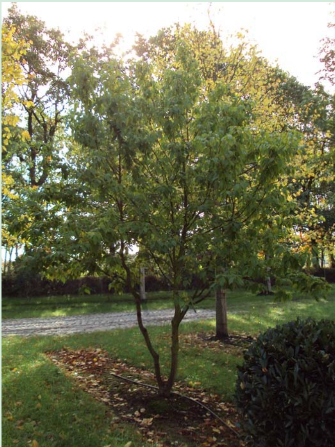
Halesia carolina Umbrella 3-4m