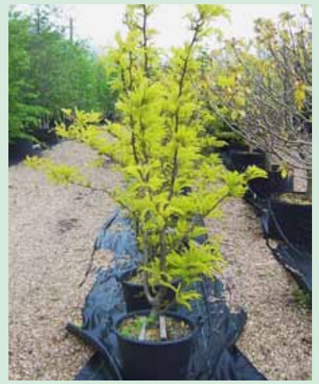
Gleditsia 'Sunburst' multistem