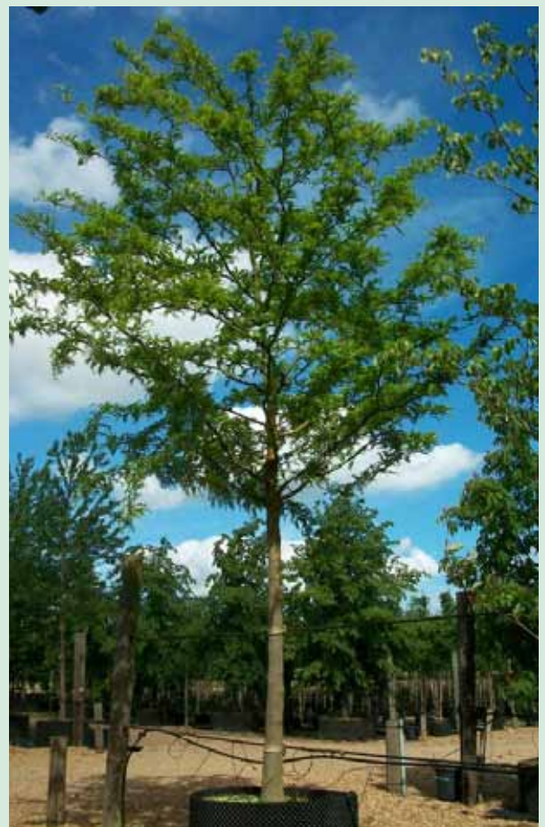
Gleditsia triacanthos 35-40 girth