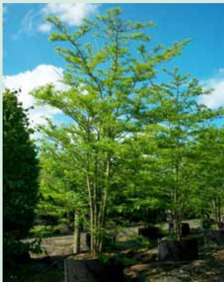
Gleditsia 'Inermis' 4.5-5.0m multistem