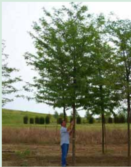
30-35cm field grown standard