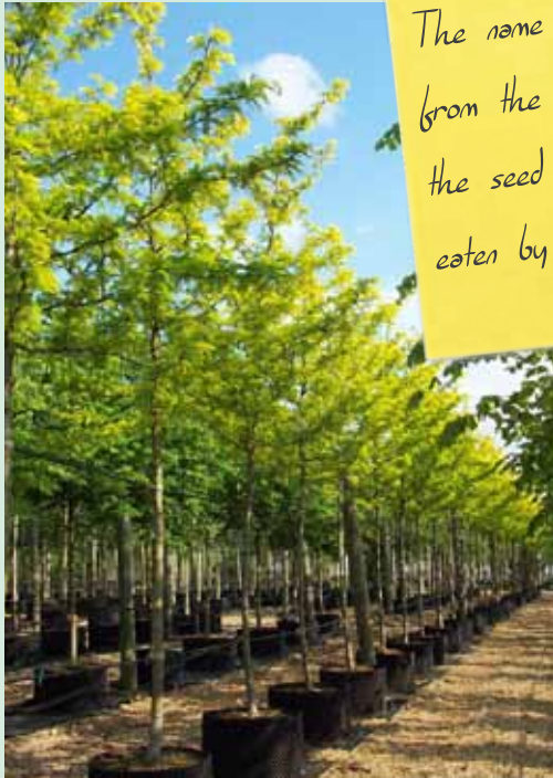
'Sunburst' 16-18cm Standard

Deepdale The name honey locust comes from the sweet pulp inside the seed pods which was eaten by Native Americans