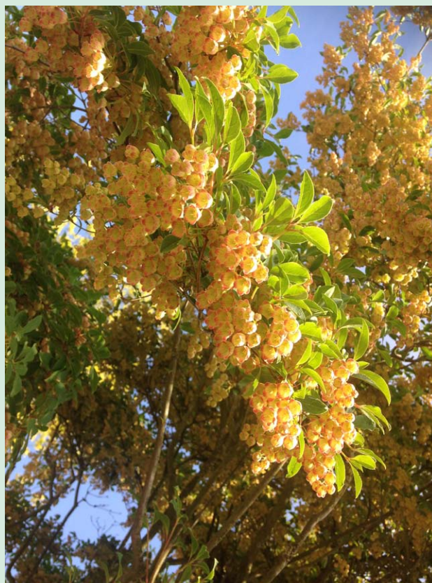
Flowers of the Enkianthus campanulatus

This pretty shrub is perfect for shady, woodland edge and gives its most brilliant autumn display on acid soil, so will plant well alongside rhododendrons.