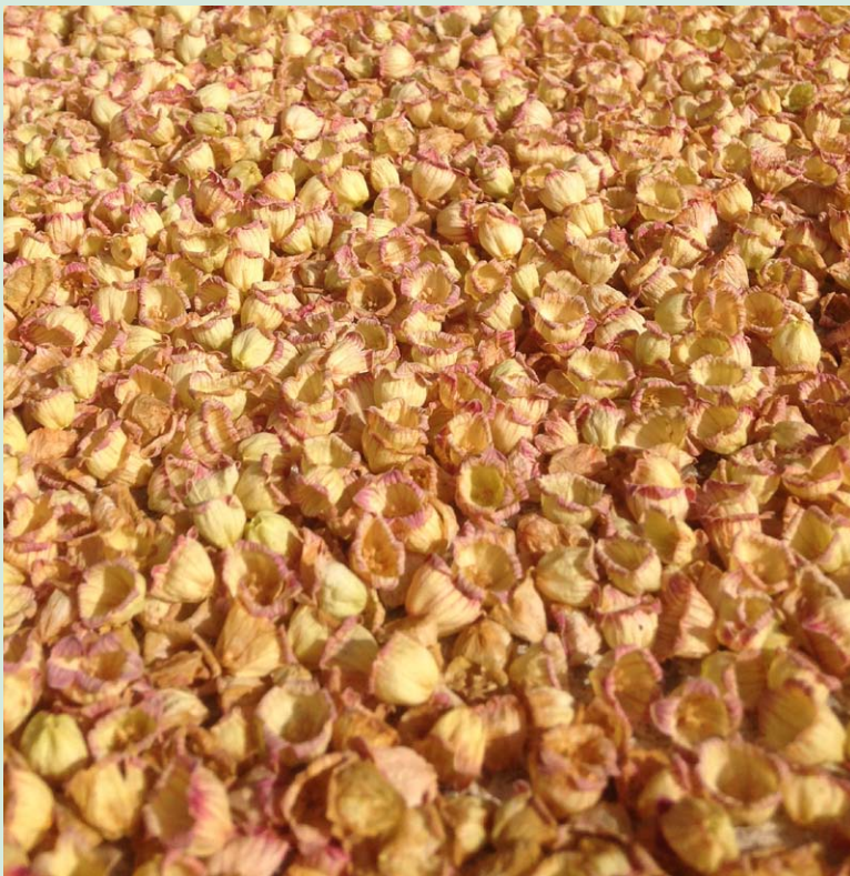
A bed of Enkianthus campanulatus flowers