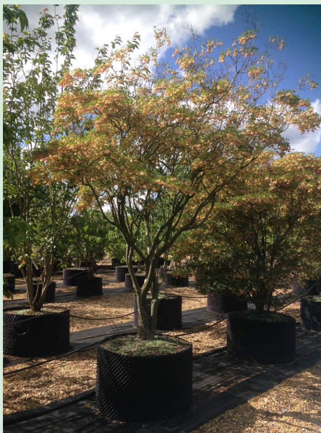
2.5-3m Enkianthus campanulatus

A spreading deciduous shrub Enkianthus campanulatus which originates from countries in North East Asia has two notable seasons.