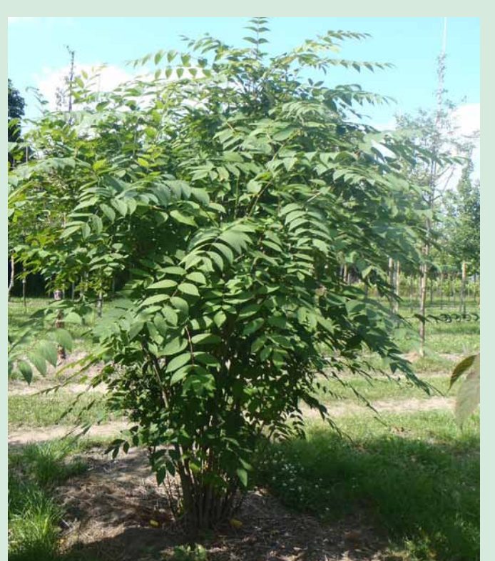
Multi Stem Decaisnea fargesii 150-200