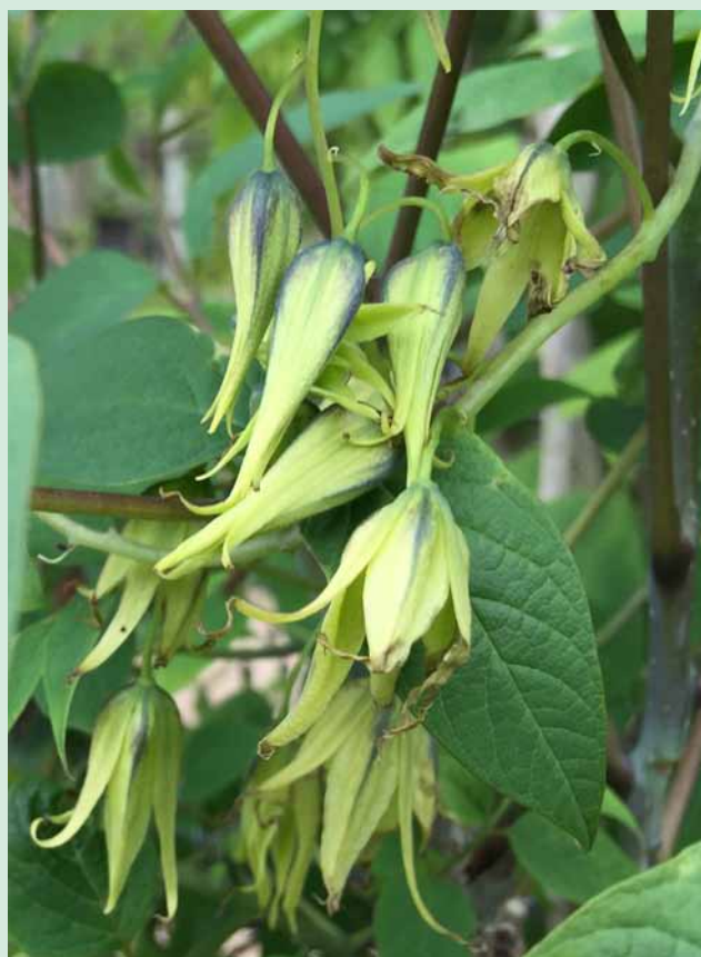
Autumn Greenish-Yellow Flowers