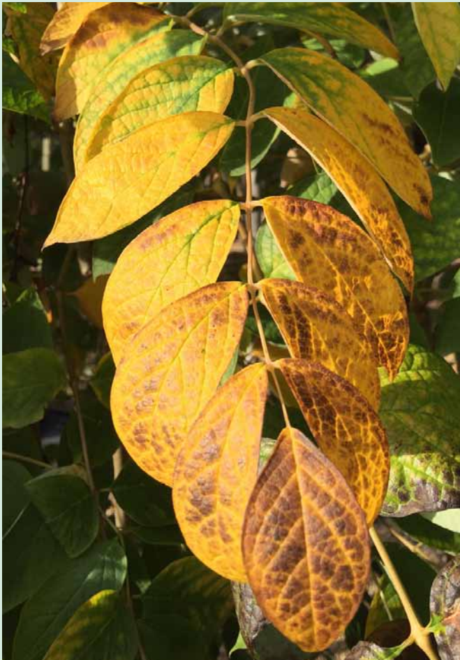
Autumn leaf of Decaisnea fargesii