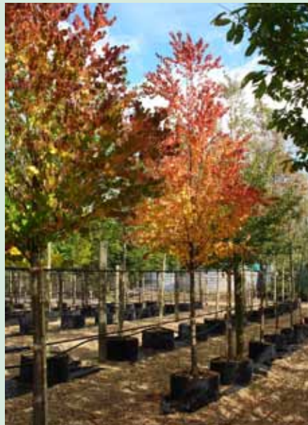
Fiery autumn colouring