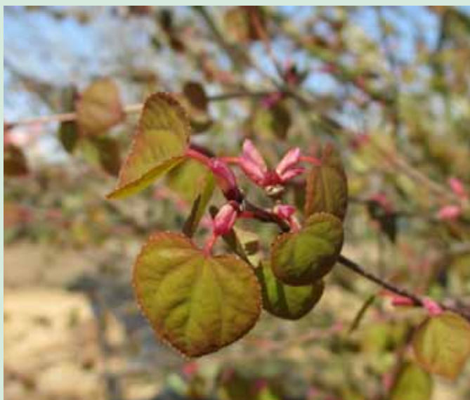
Fresh coppery growth in spring time