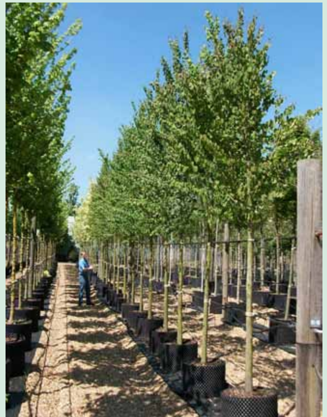
Semi mature Katsura 20-25cm girth standards