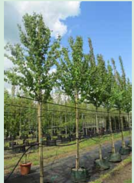
14-16-18cm girth standard Katsura