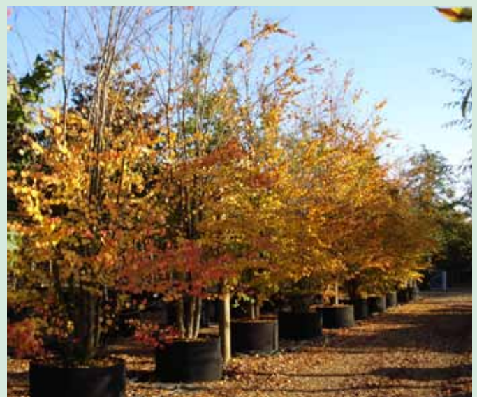
Cercidiphyllum foliage glowing in the low autumn sunshine