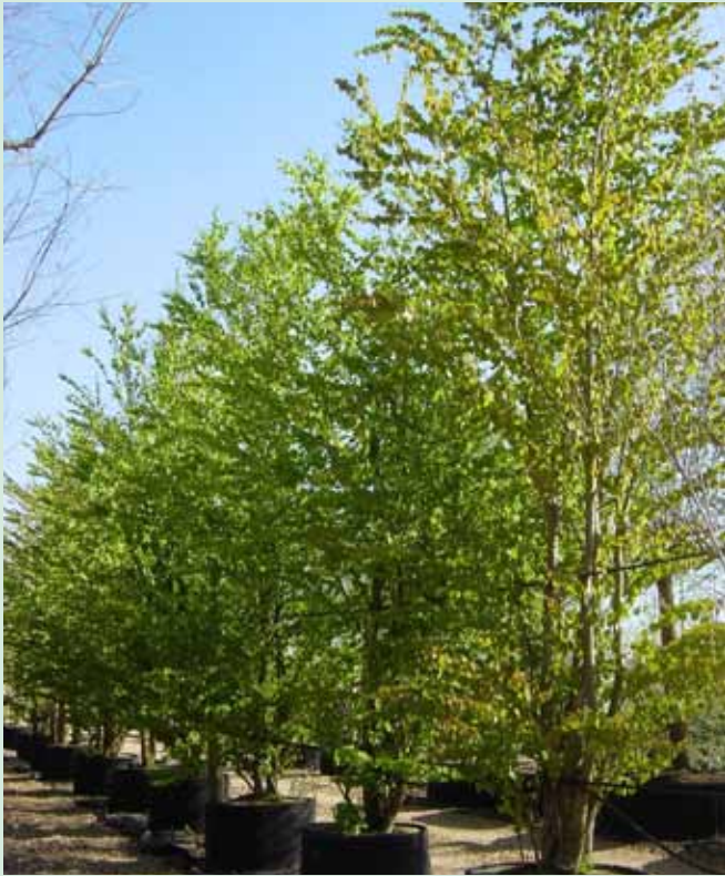
Cercidiphyllum japonicum 4-5m multistems plants

Cercidiphyllum japonicum is a beautiful tree which can grow to more than 30m in its native Japan and China, however in Britain plants rarely reach more than 15m.