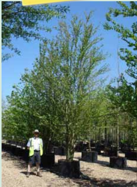
6-7m specimen multistems