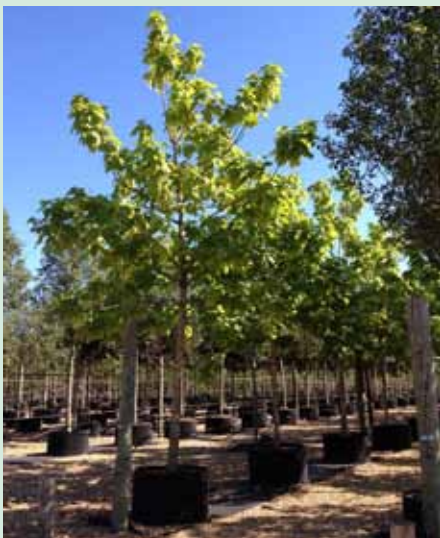
25-30-35cm girth standards in air-pot