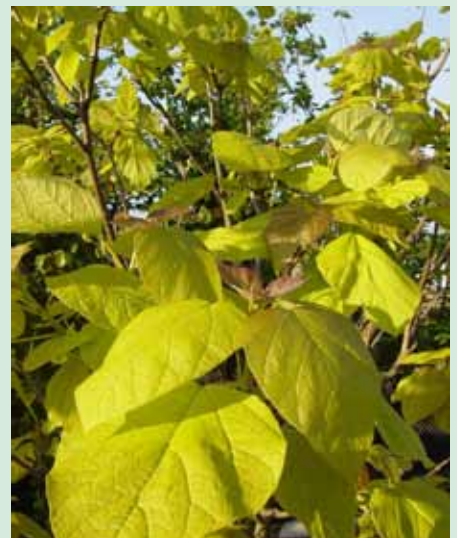
Spring foliage of Catalpa 'Aurea'