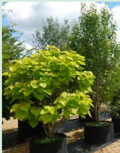
Catalpa 'Aurea' 2.0-2.5m multistem