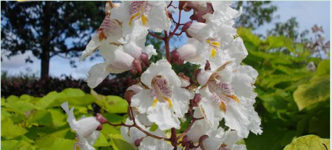
Attractive flower of Catalpa bignonioides