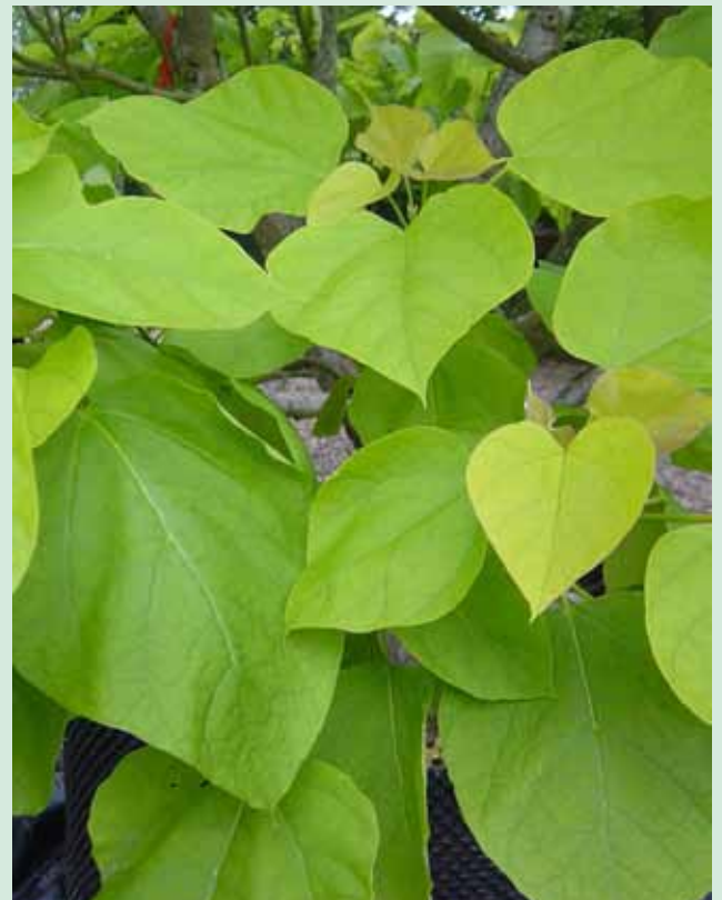
Large, bright green foliage of Catalpa