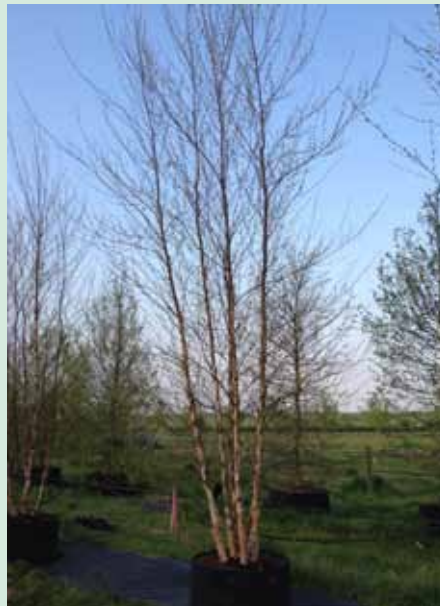
Attractive bark provides winter interest