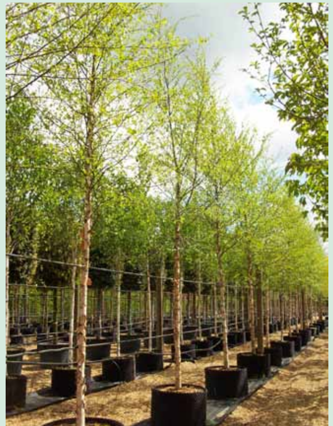
Bright green foliage emerging in spring

Bark: The most appealing feature, cinnamon coloured peeling in curly strips to reveal oranges and creams underneath.