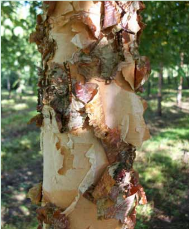
Beautiful, peeling bark provides year round interest

Betula nigra is a large, deciduous tree with the potential for growing to 25m tall with a wide, ovoid crown and gracefully arching branches.