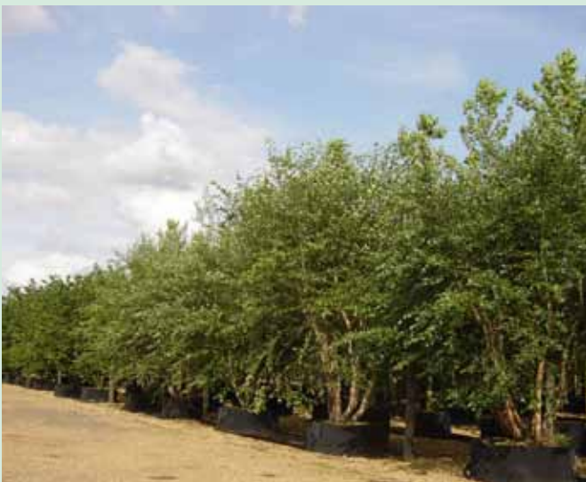
5-6m multistem Betula nigra grown in airpot container