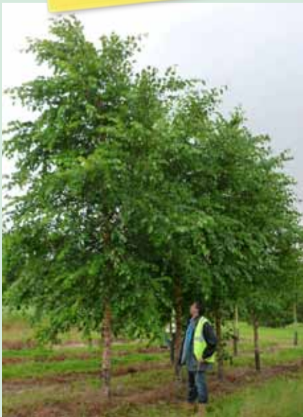
30-35cm girth field grown specimens