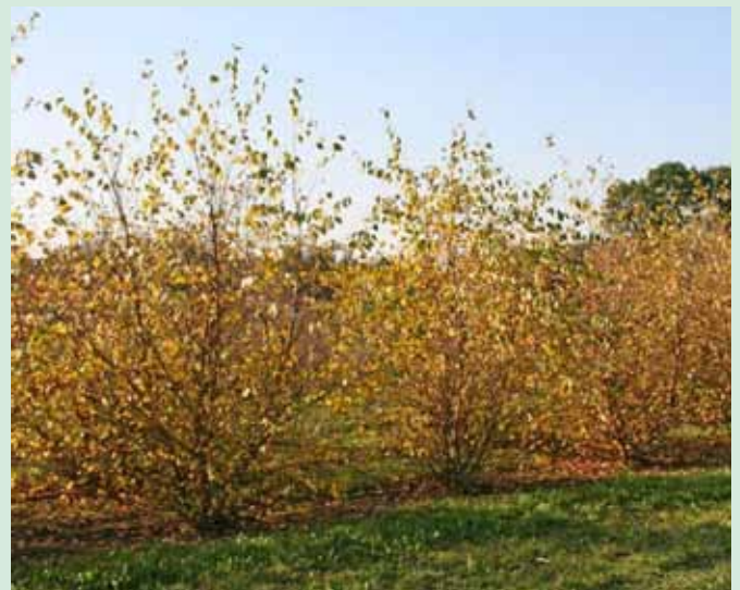
Golden autumn colours of River birch