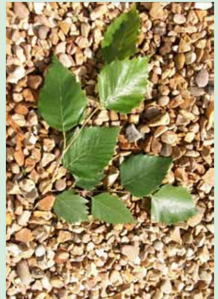
Foliage of River birch