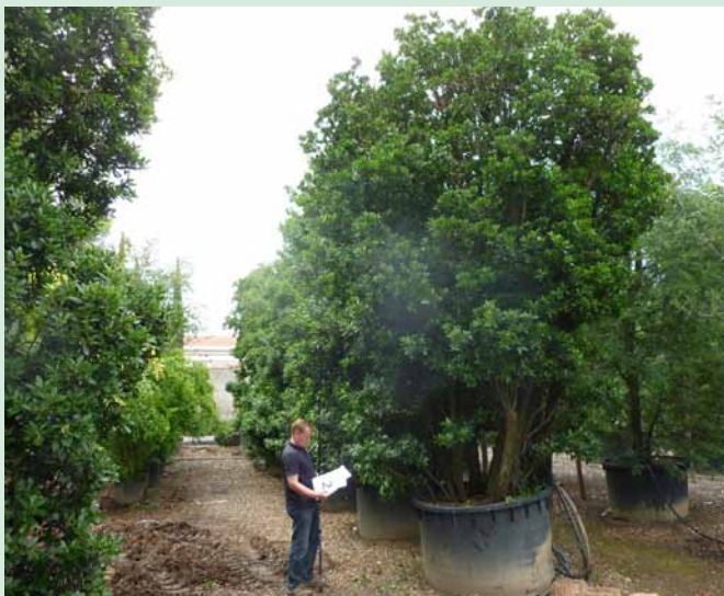
4-5m multistemmed Arbutus unedo