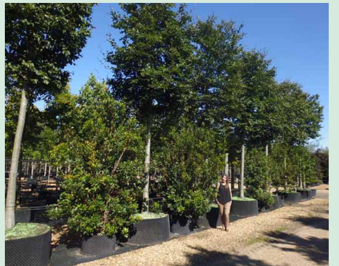
2-3m Strawberry trees in air-pots at Deepdale Trees