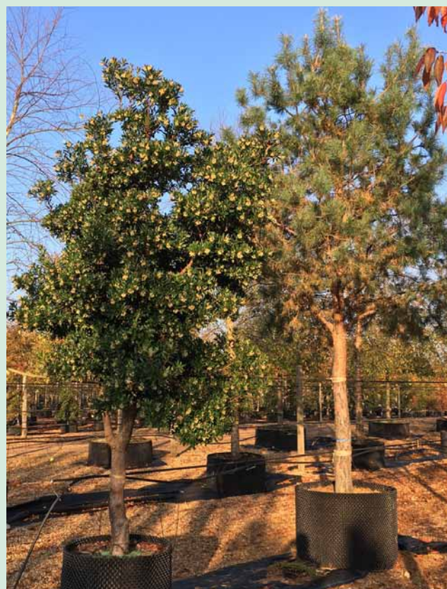
Half stem Arbutus unedo specimen