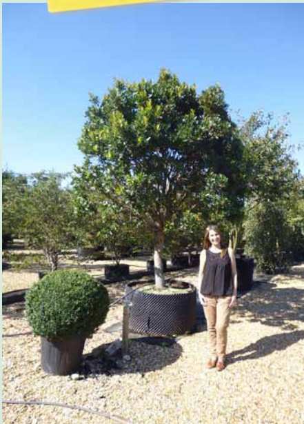
40-45cm half stem specimen