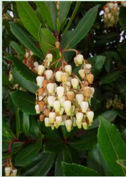
Autumn flower of Arbutus unedo