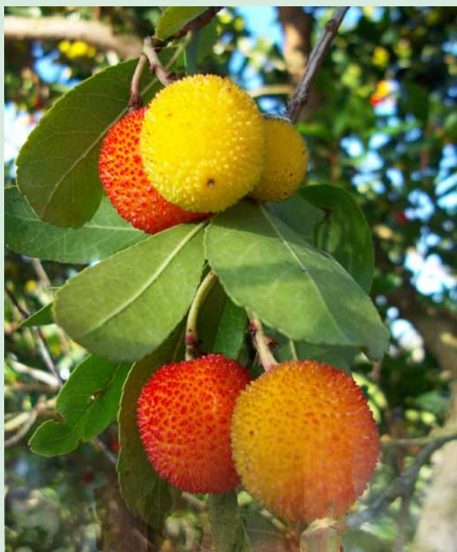
Ripening fruit of the beautiful Strawberry tree

Arbutus unedo is a fabulous evergreen plant, native to the Mediterranean and parts of western Europe. It can be grown as a shrub or small tree reaching heights up to 10m.