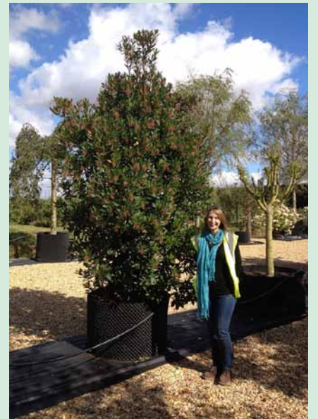
2.5-3.0m Arbutus unedo