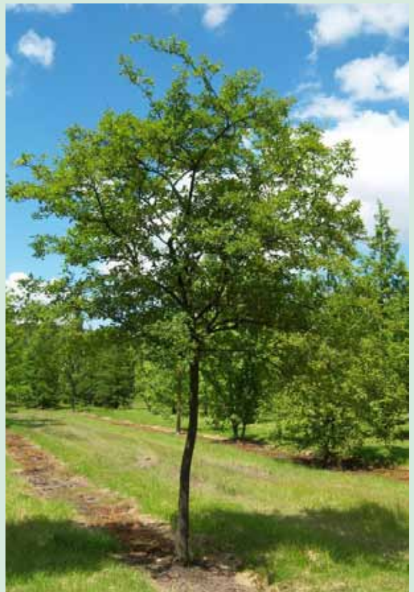
30-35cm girth Standard