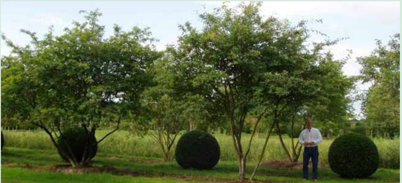
4-5m Multi-stem umbrella (Summer)