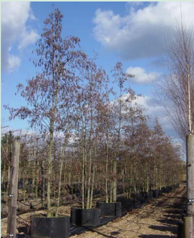
3-4 metre standard