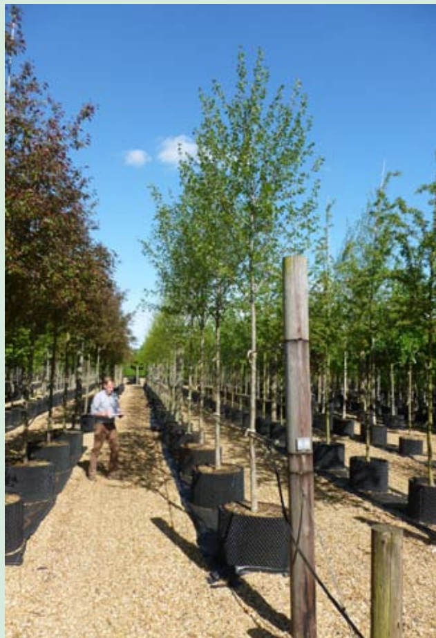
Alnus glutinosa 20-25cm girth in air pots