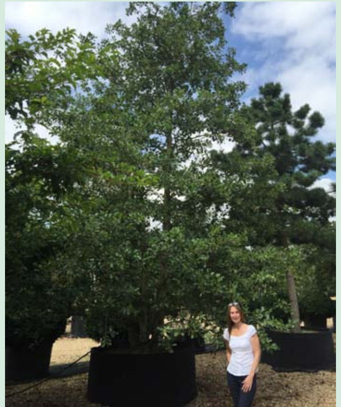
Alnus glutinosa - Multi-stem