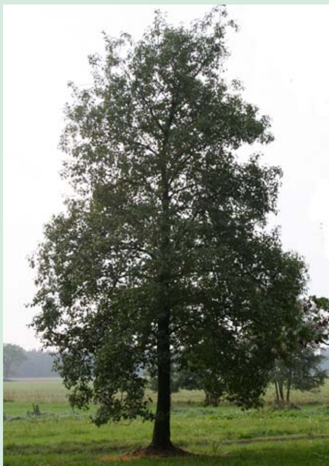
Alnus glutinosa 80-90cm girth

Alnus glutinosa , a native to Britain, which has a natural habitat in moist ground near rivers, ponds and lakes and thrives in damp, cool areas such as marches, wet woodland and streams where its roots help to prevent soil erosion. It can also grow in drier condition and sometimes occurs in mixed woodland and on forest edges.