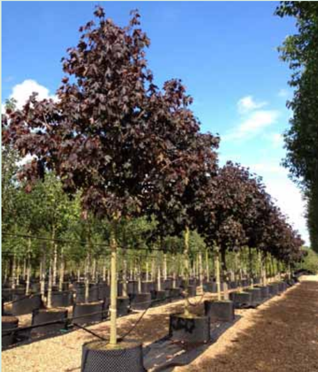
Acer platanoides Royal Red 20-25cm girth standards

To add a splash of colour to any scheme look no further than the magnificent Acer platanoides Royal Red . This American selection of Acer platanoides is a fast growing, medium sized tree which develops a wide conical crown and makes a beautiful standalone specimen.