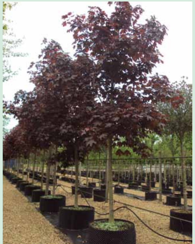
25-30cm standards grown in airpot

Fruit: Bright red 'keys' developing from the spring flowers.