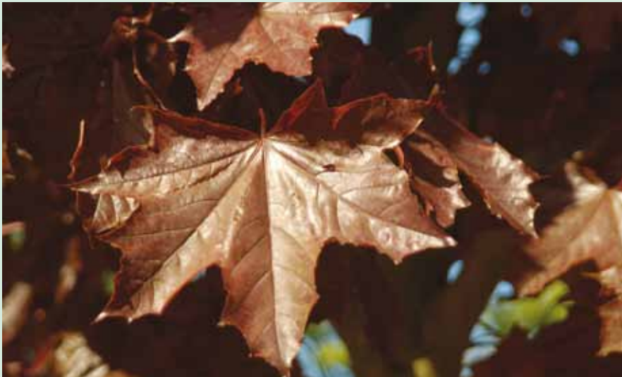
Red foliage offers a contrast in colour