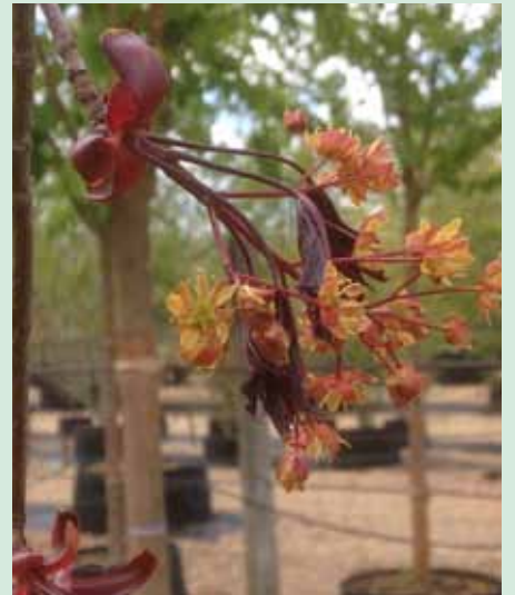
Clusters of flowers in spring