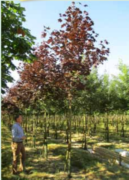
Field grown standards