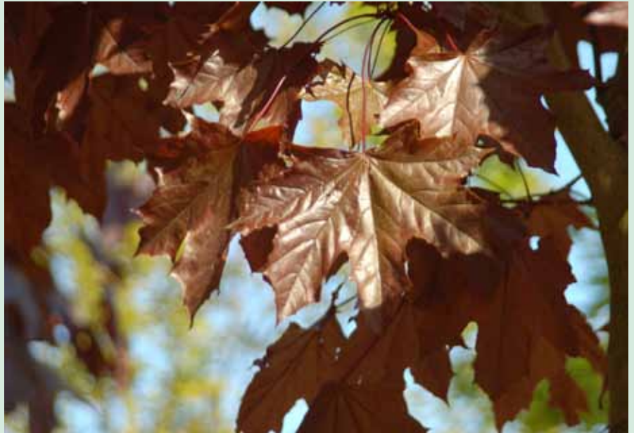
Foliage of Royal Red Maple