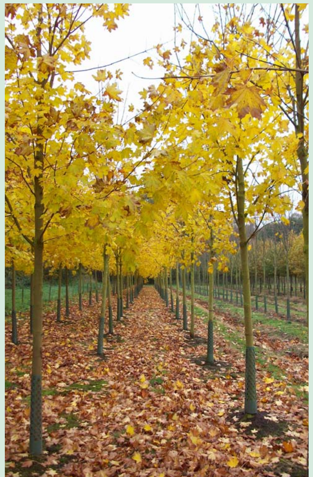
Field Grown 30-35 cm girth in Autumn

The large five lobbed leaves very like the stylized Maple Leaf on the Canadian flag are bright green throughout the summer and turn a butter yellow in the autumn occasionally finishing with orange. The effect becomes more and more spectacular as the tree grows to maturity due to the size of the tree.