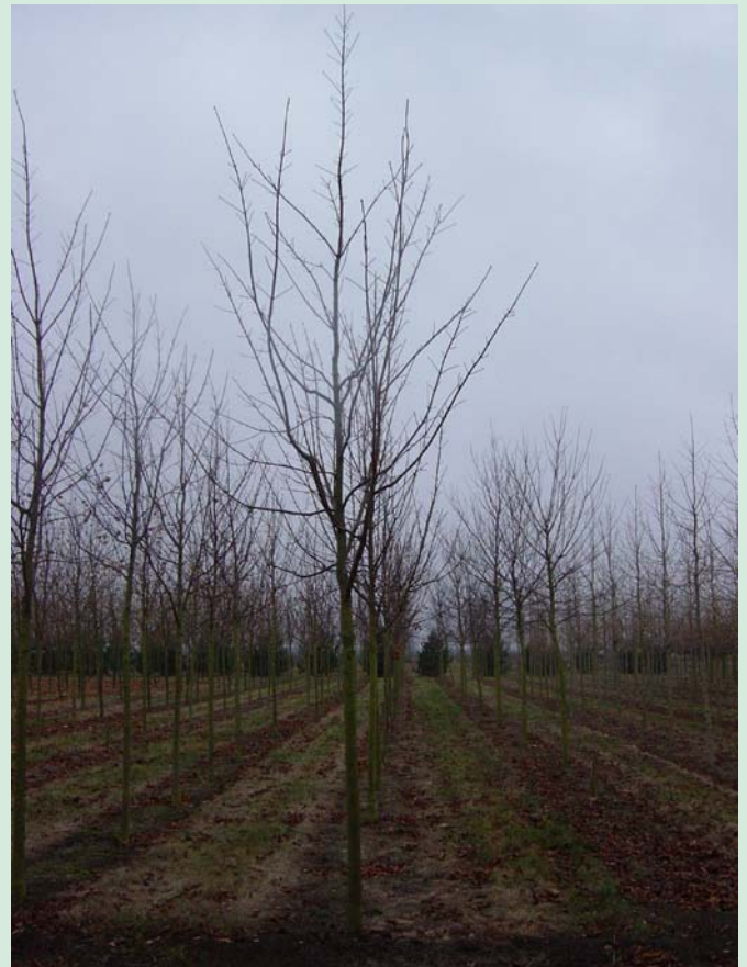
Winter – 20-25 field grown