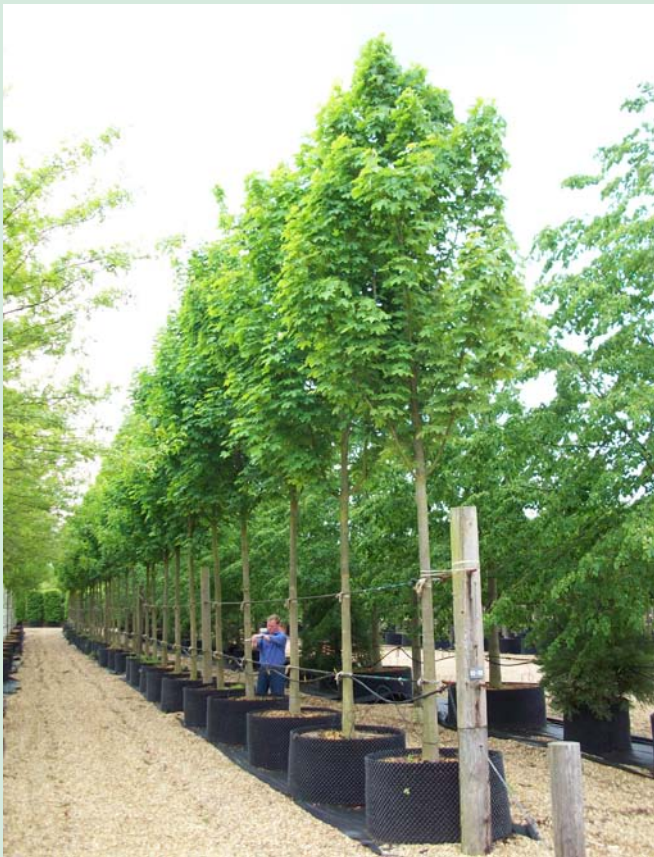
Container Grown 30-35 cm girth in summer

A hardy fast growing large deciduous tree Acer platanoides 'Emerald Green' has a good upright form with a dense, symmetrical, rounded to oval crown making it ideal for avenue and urban planting. The bark is beautifully patterned with vertical and interlaced ridges.