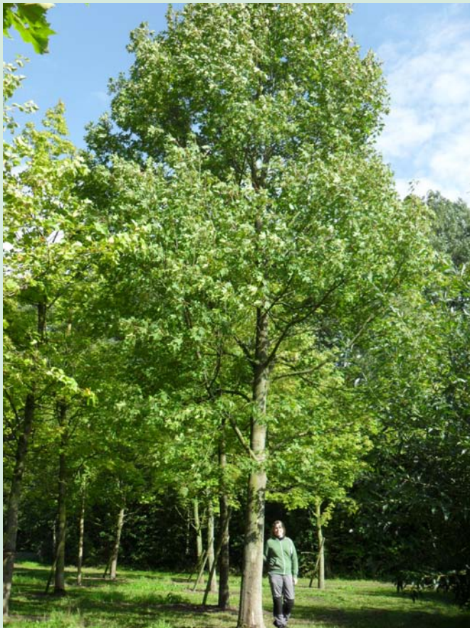
Large field grown 70-80cm girth